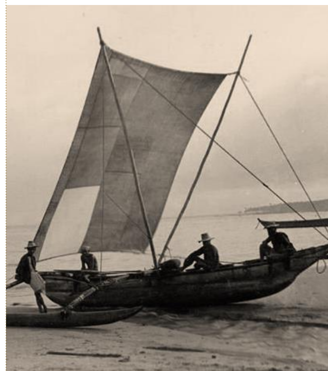
A fishing boat at Mutwall, Ceylon: 1880 - 1905