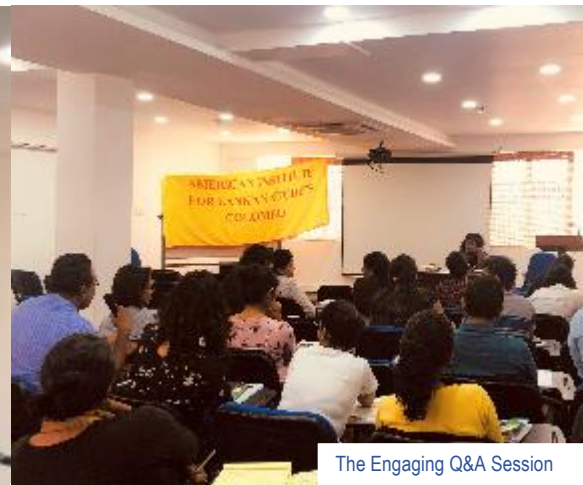
The Engaging Q&A Session