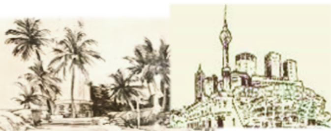
Old Images of Sri Lanka

5/22, Sulaiman Terrace, Colombo 5. Sri Lanka. Tel. 94 11 2508512, 94 11 4513706 Email: aisls@sltnet.lk Web: https://www.aisls.org https://www.facebook.com/SriLankanStudies